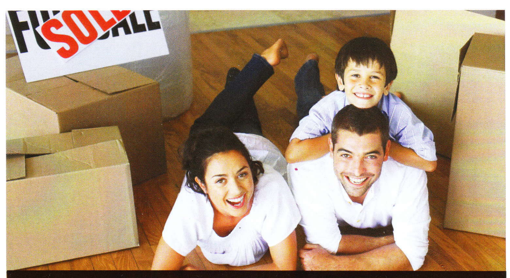
Call Us Today For Information On Our Loan Programs!

Call or email us to talk to an experienced MH team member today.